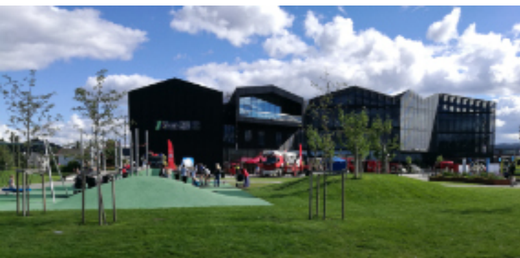
KIMEN, "The SEED" - Stjørdal cultural center