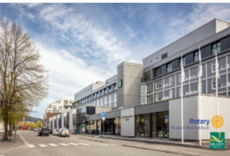
Quality Airport Hotel - Accommodation in Stjørdal