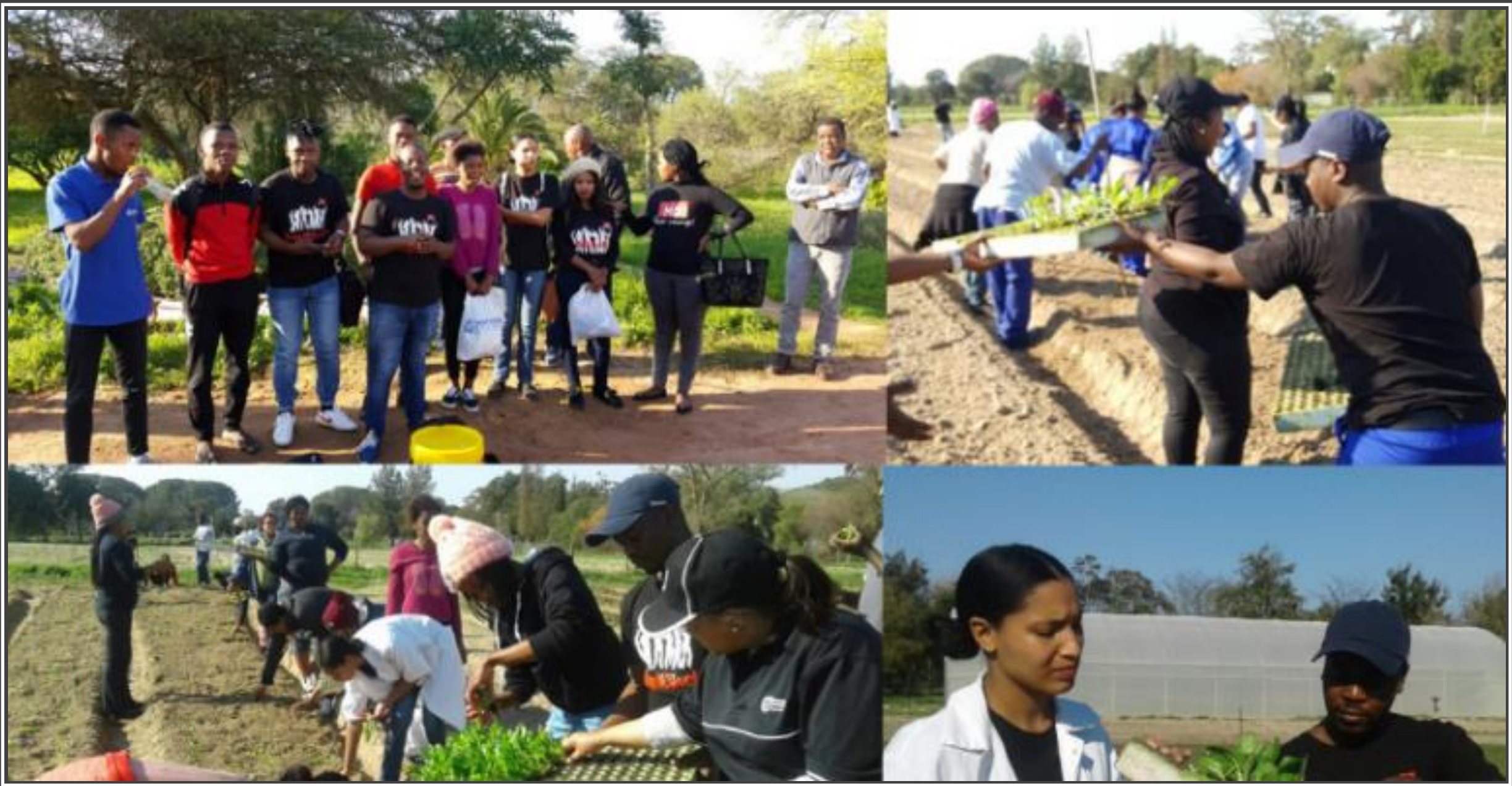
Planting av nyttevekster i Sør Afrika